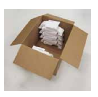
Packaging: 25 linking spacers are shipped in a box 20" x 15 1/2" x 14"h @ 11.5 lbs.

Colors available: white standard, any color by request subject to min. quantity.